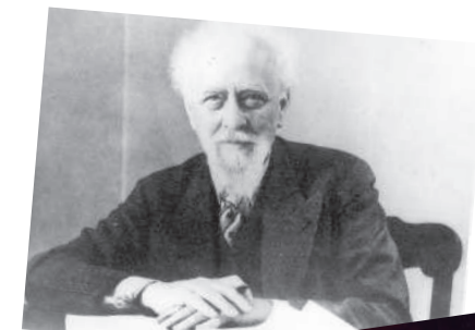
Jean Baptiste Perrin (above) provided a new understanding of Robert Brown's notion of random motion.